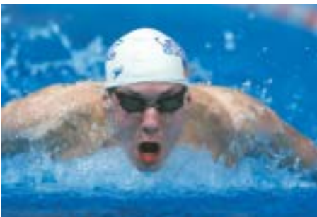
Swimmers will be vying for a spot on Team USA at the 2004 Olympic Trials.

The competition will be part of a four week