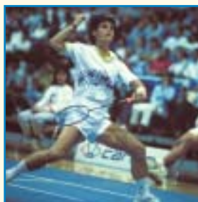
Badminton is one of the fastest growing sports in Southern California.

In an effort to better promote its sport in the U.S., the International Badminton Federation (IBF) have announced plans to open a Pan American Continental office in Anaheim, Calif., marking the first time an international sports federation has had an office in Southern California.