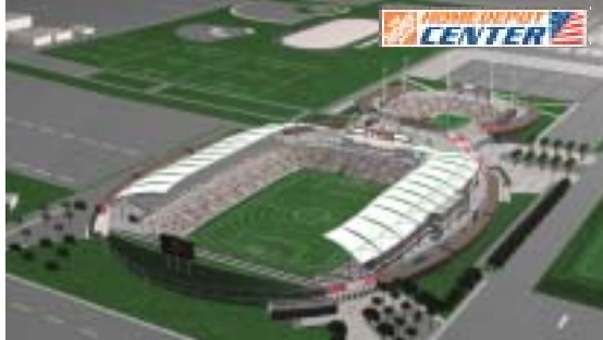
A 27,000-seat soccer stadium is the new home of the Galaxy, 2002 MLS Cup Champions.

"The Home Depot Center represents the largest private investment into amateur athletics in America's history. These facilities will develop