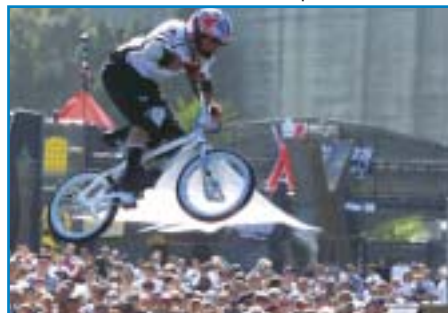
The X Games generate large dollars for its host city.

The X Games will feature competitions in BMX