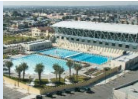
The renovated complex as it stands today.