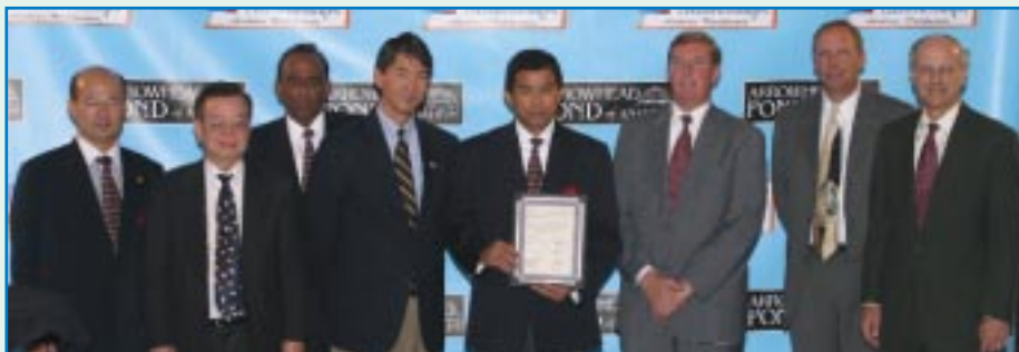
Korn Dabbaransi, deputy prime minister of Thailand and president of the IBF, visited Anaheim to preside over the official opening of the organization's Pan Am office and to participate in the ceremonial signing of the contracts that will bring the 2005 World Badminton Championships to the Arrowhead Pond.

To request more information on the 2005 World Badminton Championships, visit www.usabadminton.org .