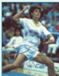
Badminton is one of the fastest growing sports in Southern California.

Southern California has more badminton players than any other region in the United States and the International Badminton Federation (IBF) recognized that fact by awarding the 2005 World Badminton Championships to the Arrowhead Pond. The event will be held August 15-21 and will feature approximately 350 athletes from 40 countries vying for five world titles: men's and women's singles, men's and women's doubles, and mixed doubles.